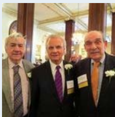
Distinguished Counsellors Class of 1963