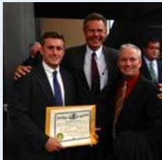
2nd District Admission Ceremony, October 2013