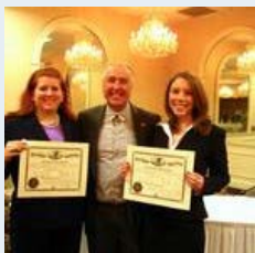
3rd District Admission Ceremony, October 2013