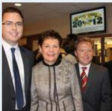
4th District Admission Ceremony, October 2013