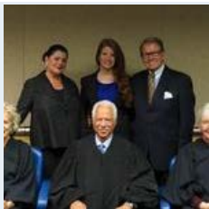
1st District Admission Ceremony, October 2013